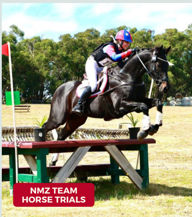
NMZ TEAM HORSE TRIALS

YHPC team winning the "John Barlee Perpetual Shield" award as the team with the highest aggregate points in the State Horse Trials, grades 1 to 3 section.