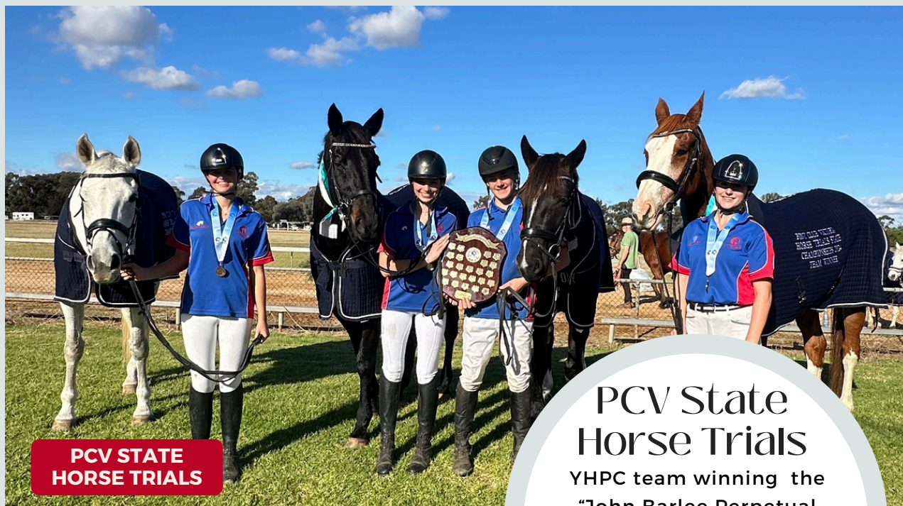
PCV STATE HORSE TRIALS